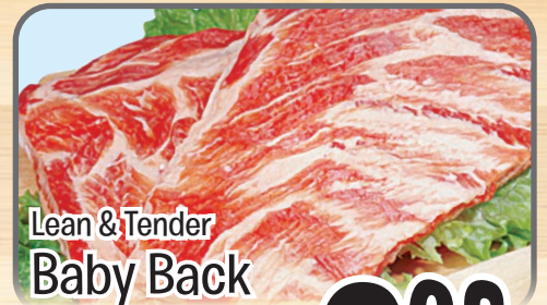
Lean & Tender Baby Back Pork Ribs

Perfect for Oven Slow Bake or On the Grill - Born, Raised & Harvested In The U.S.A.