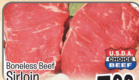
Boneless Beef Sirloin Steaks