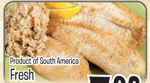
Product of South America Fresh Tilapia Fillets

Farm Raised Fresh Never Frozen 100% Satisfaction Guaranteed!