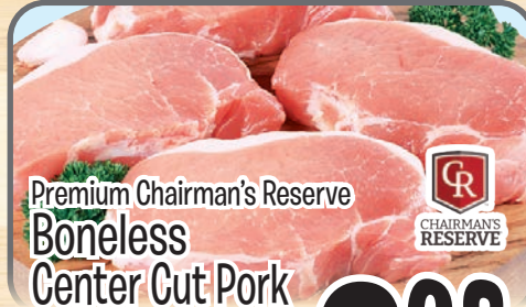
Premium Chairman's Reserve Boneless Center Cut Pork Chops Or Roasts

Roasts Have Pop-up Timers Hand Selected • Deep Pink Perfectly Marbled