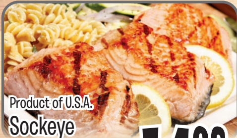
Product of U.S.A. Sockeye Salmon Fillets

Wild Caught • Previously Frozen Brookside's Seafood 100% Satisfaction Guaranteed!