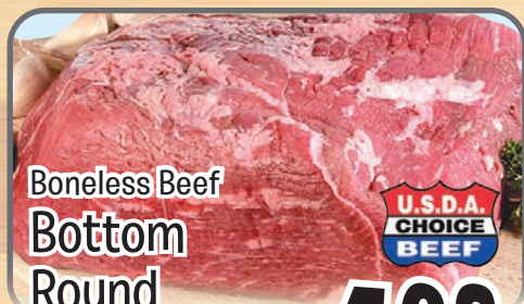
Boneless Beef Bottom Round 'Pot' Roast

At Brookside, you can always be sure that our Beef & Veal is U.S.D.A. Choice, and our Pork is hand selected & trimmed - deep pink - perfectly marbled, and ALL of our fresh Meat is trimmed to perfection and born, raised & harvested in the U.S.A.!