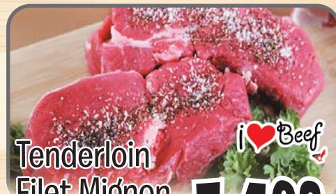
Tenderloin Filet Mignon Steaks