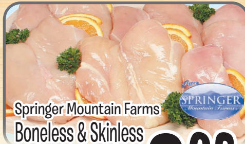
Springer Mountain Farms Boneless & Skinless Chicken Breasts

No Antibiotics, Hormones Or Growth Stimulants