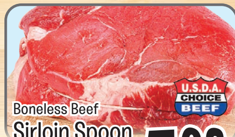
Boneless Beef Sirloin Spoon Roast