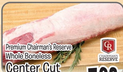
Premium Chairman's Reserve Whole Boneless Center Cut Pork Loin