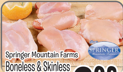
Springer Mountain Farms Boneless & Skinless Chicken Thighs

Brookside's Chicken is all natural, and our Pork is hand selected & trimmed - deep pink - perfectly marbled, and ALL of our fresh Meat is born, raised & harvested in the U.S.A.!