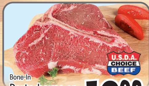
Bone-In Porterhouse or T-Bone Steaks